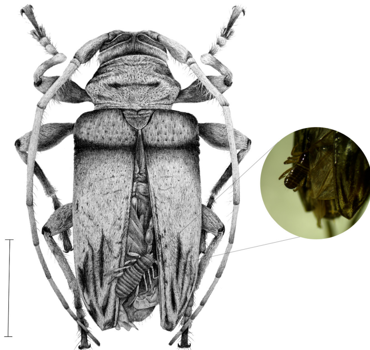
Figure 2. Illustration of the male Cordylochernes scorpioides (Linnaeus, 1758) (Chernetidae) hidden under the elytra of Oreodera rufofasciata Bates, 1861. Scale bar: 1 cm. / Ilustración del macho Cordylochernes scorpioides (Linnaeus, 1758) (Chernetidae) escondido bajo los élitros de Oreodera rufofasciata Bates, 1861. Barra de escala: 1 cm.