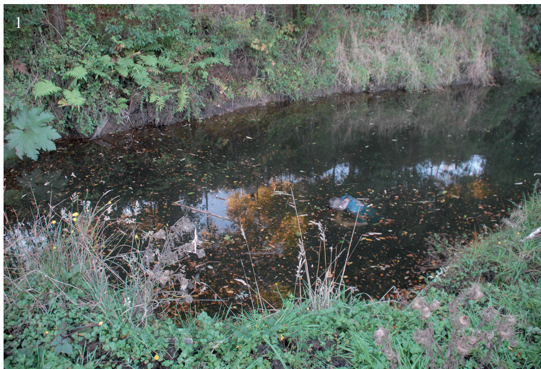
Figure 1. A floating corpse of 47 year-old man found in Peñehue, Región de La Araucanía, Chile.

Finding, forensic and medico-legal information. On April 12, 2014, a corpse of 47 year-old man was found floating in an artificial freshwater pond in the locality of Peñehue (39°00'6,2" S - 73°04'37,0" W), Región de La Araucanía, Chile. The corpse was found less than 2 m from the shore, in the early floating stage (Payne and King 1972), and only his back and neck were exposed to the air (Fig. 1). The technical-scientific report provided by Chilean Investigate Police (PDI) officers and the autopsy Protocol performed by Medical-Legal Service's (SML) forensic examiners, which contain forensic and complementary medico-legal information respectively, were requested and reviewed. The cause of death was asphyxia by drowning.