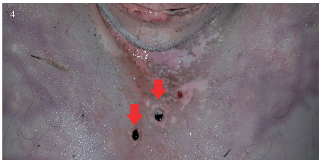
Figure 4. Two Rhantus validus adults (indicate with red arrows) associated to a postmortem artifact in upper chest.

Some aquatic insects can be facultative scavengers under specific ecological conditions (Merritt and Wallace 2001). The exclusive presence of R. validus adults in this finding and their facultative necrophagous behavior can be related to the ephemeral condition of this aquatic environment, which had no prey availability and received water only from rainfalls. Although R. validus larvae were not observed in this finding and have not been described in the literature as scavengers, it may be possible that under the ecological conditions noted above, these immature stages could have a similar feeding behavior, since there is a morphological similarity between Dytiscidae adults and larvae mouthparts (Alarie et al. 2009).