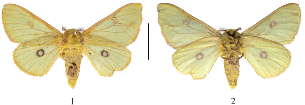
Figures 1-2. 1. Dorsal side of phenodeviant specimen of Catharisa cerina CIPLT 451. 2. Ventral side of phenodeviant specimen of Catharisa cerina CIPLT 451. Scale: 2 cm.

We refrain from speculating on the potential causes of the phenodeviance in this specimen, but note that previous studies have shown that environmental stresses can result in shape changes in at least some species of Lepidoptera (Balazuc 1956; Hoffman et al. 2002), whilst inbreeding has been suggested as a cause of similar malformations in Diptera (Rasmuson 1960). Given the high levels of habitat disturbance in the buffer zone of the reserve area and the highly localised distribution and rarity of this poorly known moth, both of these factors must be considered possible contributors to the malformation observed in this case.